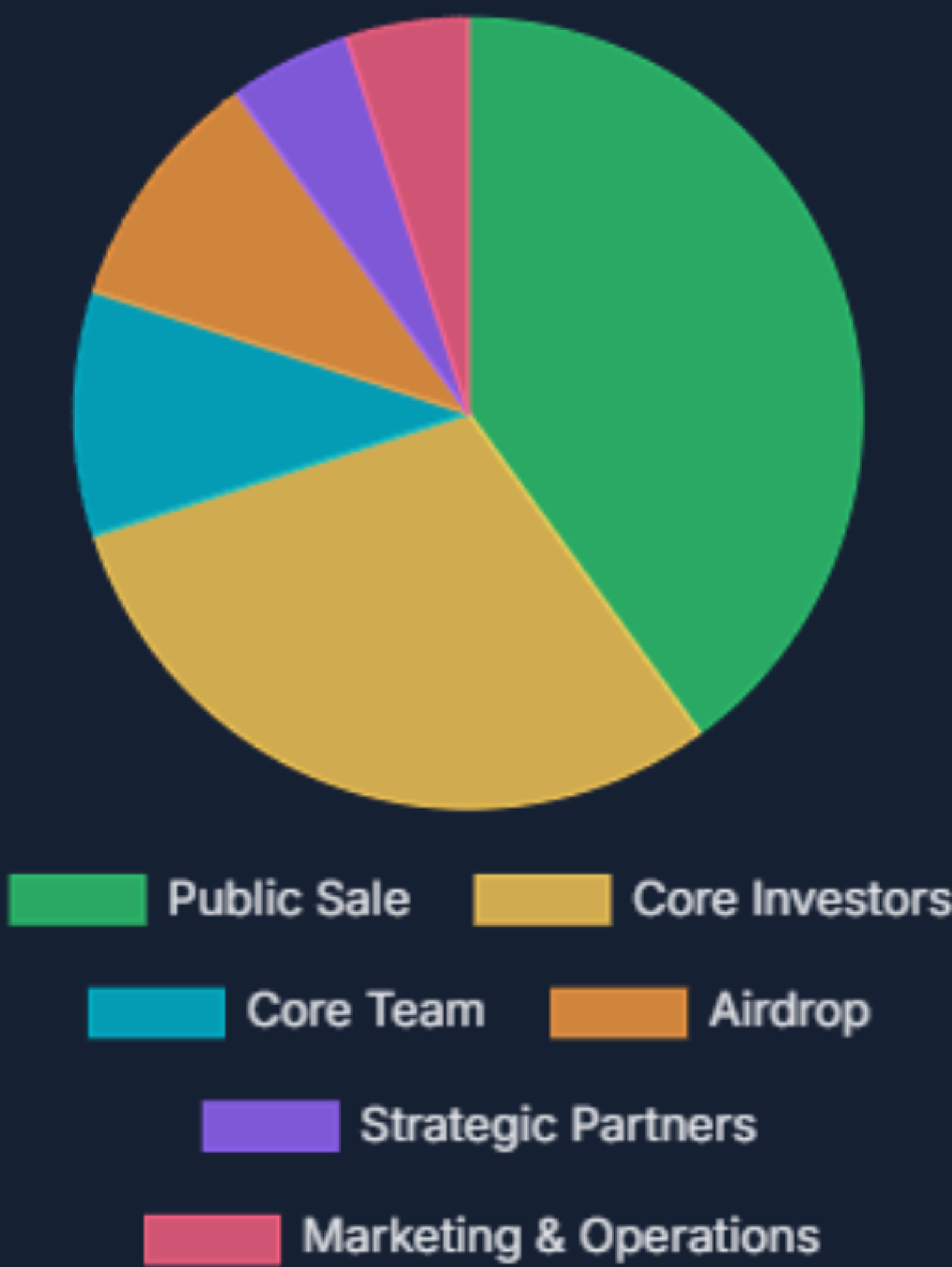
PixCo Token Distribution